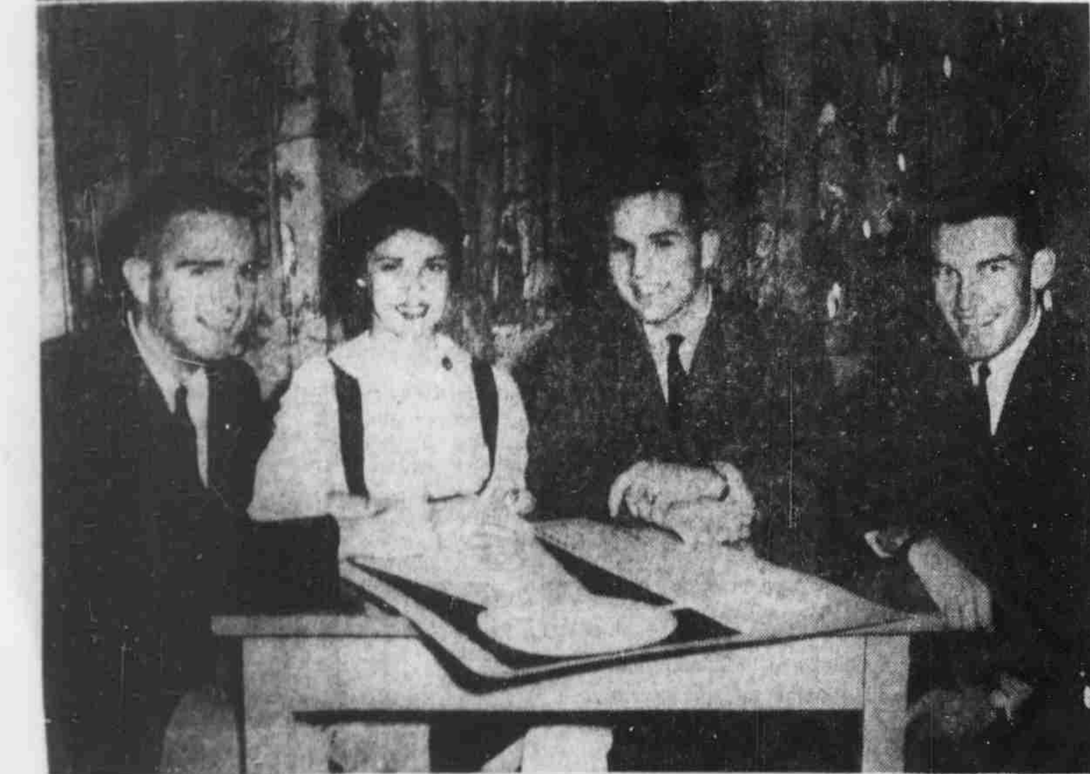
University Party 'Big Four'