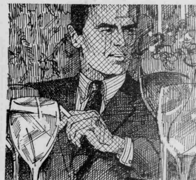
its flared collar...