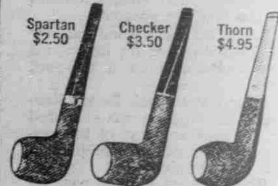
Official Pipes New York World's Fair

No matter what you smoke you'll like Yello-Bole. The new formula, honey lining insures Instant Mildness; protects the imported briar bowl—so completely, it's guaranteed against burn out for life. Why not change your smoking habits the easy way—the Yello-Bole way. $2.50 to $6.95.