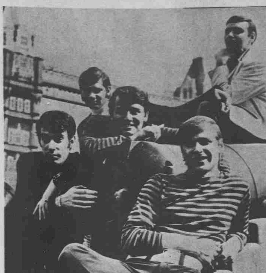
Jay And The Americans

His performance is free to students and $1 for the general public.