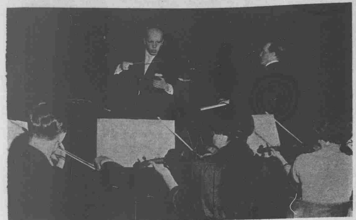
Paris Chamber Orchestra