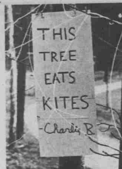
So Are The Kites . . .

WRITE: College Relations (ACPCR) Hq Aeronautical Chart & Information Center, 8900 S. Broadway, St. Louis, Missouri 63125 An equal opportunity employer