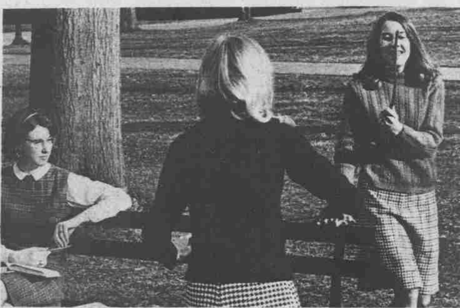
Warm Weather Antics

LOST — Gray Schnauzer puppy, 8 months old. Ears, tail clipped. Wearing red collar with ID tags. $25.00 reward for return or information leading to recovery. Call 933-2301 or 942-1924.