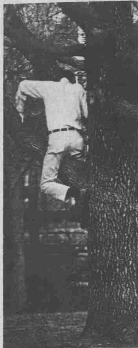
Silly Season Studying

Carolina students are famous for knowing how to relax—you can spot it anywhere on campus. One well-dressed guy on his way back from classes suddenly notices a gnarled, knobby old tree—everybody knows they're the best kind for climbing. He slings his books to the ground and heads for it like a duckling who just spotted his mother.