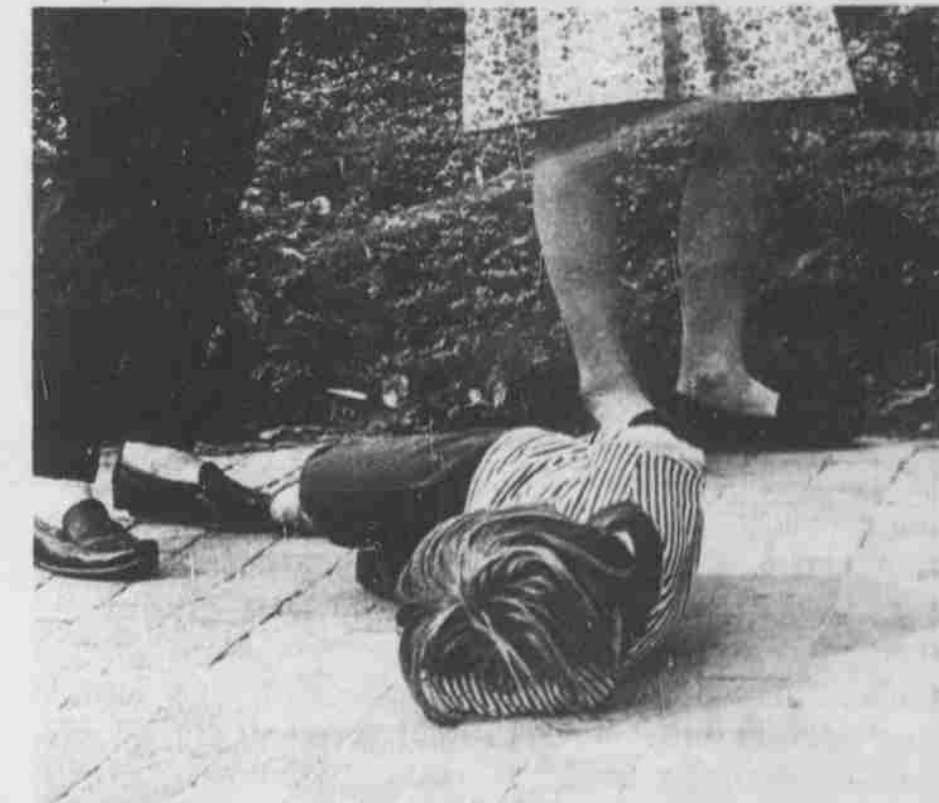
. . . Before Tiring of Their Talk