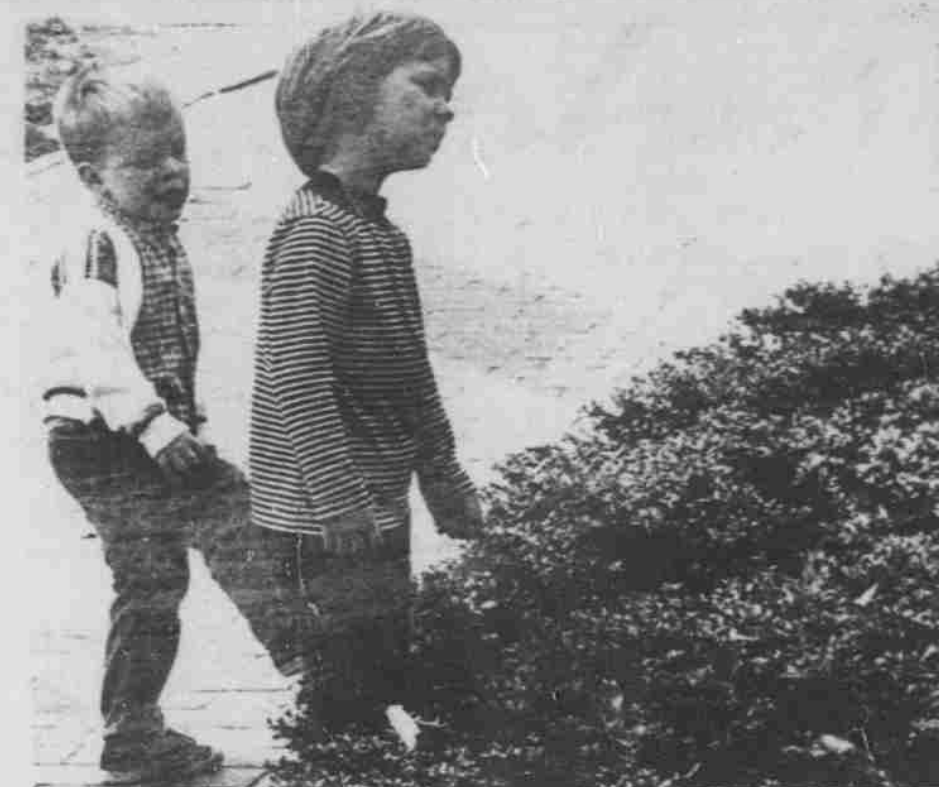
A Girl Child Looks At Her Elders . . .

IMPORTS REPAIRS VW, TRIUMPH, MG, AUSTIN HEALY, Etc. HOLIDAY IMPORTS Durham-C. H. Blvd. 489-2704