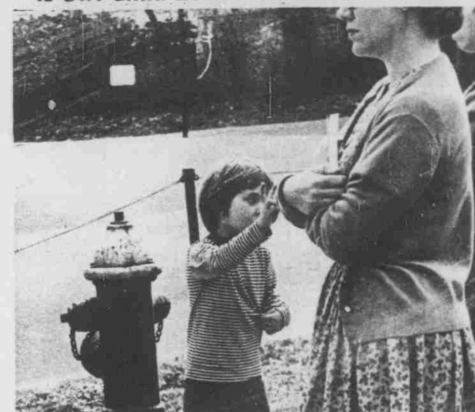
. . . And Listens To Their Words . . .