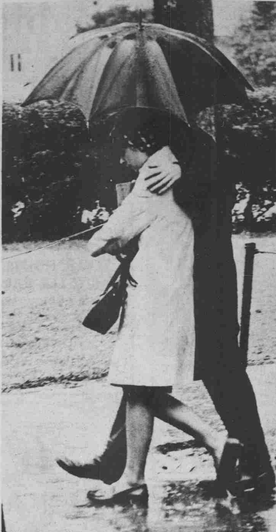
TYPICAL DAY — This is not such an unusual scene around Chapel Hill these days. It seems that into every day a little rain must fall. But, you have to admit, if you have to live through a rainy day, it's nice to have some one to live through it with you — DTH Photo By Ernest Robl