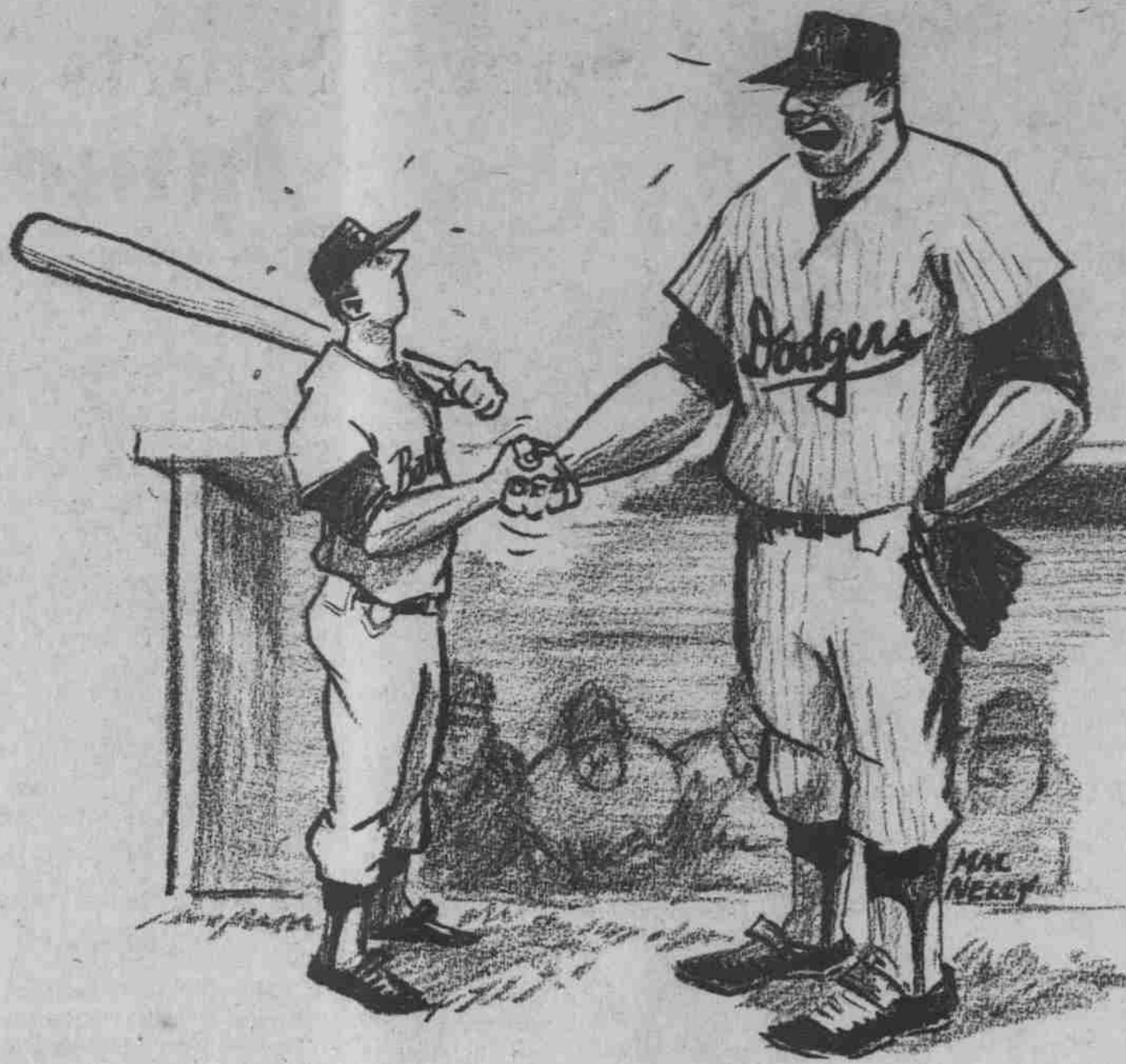
"Welcome To National League Pitching . . ."

First baseman Boog Powell also drove in more than 100 runs while third baseman Brooks Robinson knocked in 99. In addition, Powell hit 34 homers and Brooks Robinson and outfielder Curt Blefary 23 each.