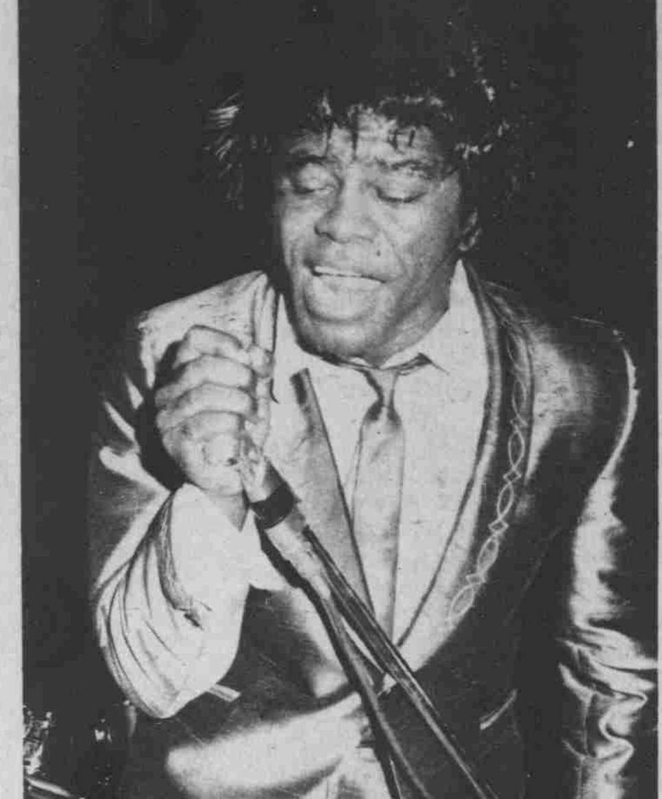
Prisoner Of Love

for the chat." James: "Well, go see the rest of the show and then come back and let me know what you think. You can leave the recorder here. I'll sign some pictures for you. You can pick them up after the