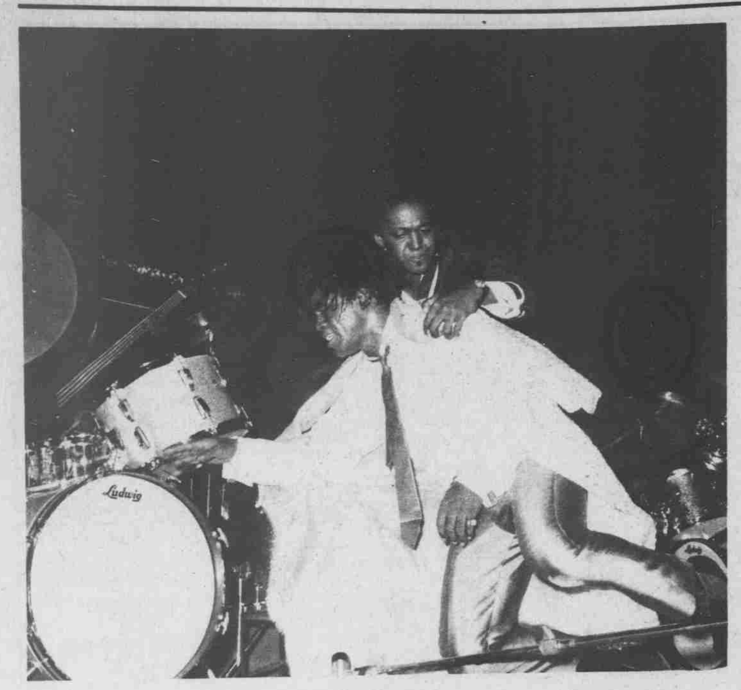
Please, Please Me

Everything new that could happen... happened! Now at your Chevrolet dealer's!