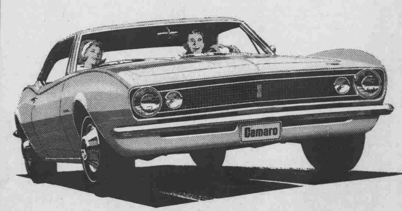
Camaro Sport Coupe with style trim group you can add.

All standard—Strato-bucket seats. Carpeting. Rich vinyl upholstery. A 140-hp Six or a big-car V8 (210 hp!), depending on model. New safety features like dual master cylinder brake system with warning light.