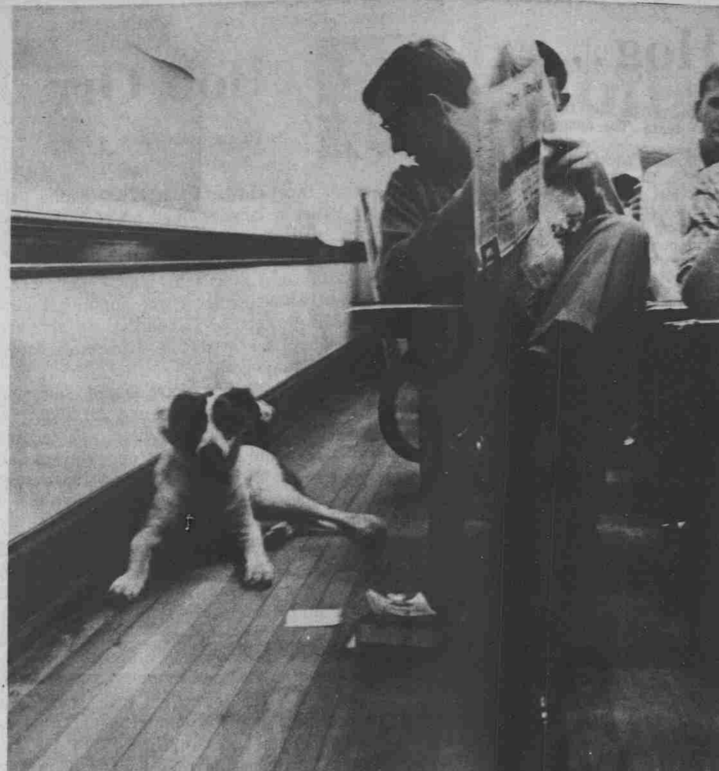
IF YOU'RE ONE OF THOSE who think that the DTH has been publishing too many dog pictures: take that. This is Sig the DTH Dog of the Week, a Sophomore majoring in Liberal Arts (No bones about it.) He's here caught flat-footed in a Political Science 86 class. Sig is in the Sigma Phi Epsilon fraternity.

If you have any questions concerning your military obligation or Naval Aviation please contact the team and they will be happy to answer any of your questions. They can administer you the written examinations and help you make arrangements to go to Norfolk for the physical examination and final processing of your application.