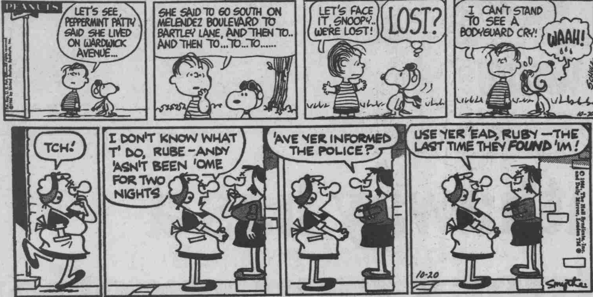
© 1966 by Schulz. All Rights Reserved. "The Mamas and the Papas" by Schulz.