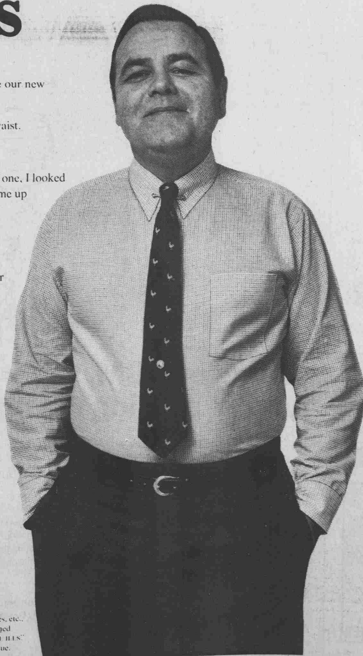
Jonathan Winters, star of television, motion pictures, etc., is both author and cartoonist of the recently published "MOUSE BREATH, CONFORMITY AND OTHER SOCIAL ILLS." In our picture he is wearing Hathaway's Discocheque. About $9.50.

Winters: Great. As soon as I get some weight off, I'll be wearing 'em again.