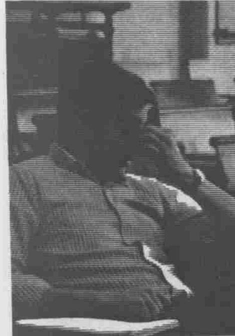
When You Must Keep Alert

Presently, the Tar Heels and Terrapins are undefeated in league play and have both been victims to the midshipmen of Navy.