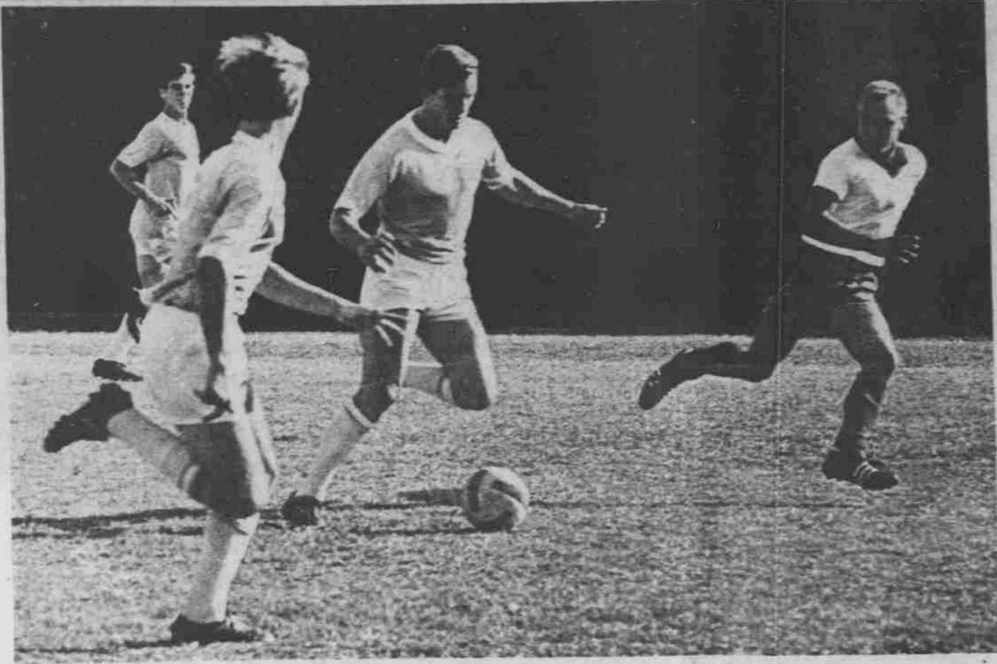
Carolina's Offense On The Move