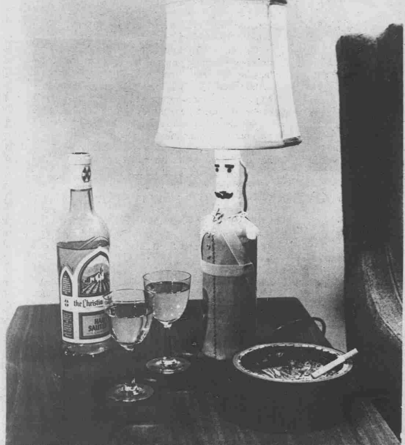
POP THE CORK FOR SOME HOME DECORATING inspirations... Like this unusual soldier lamp made out of a wine bottle — trimmed with extra bits of crepe paper and ribbon.