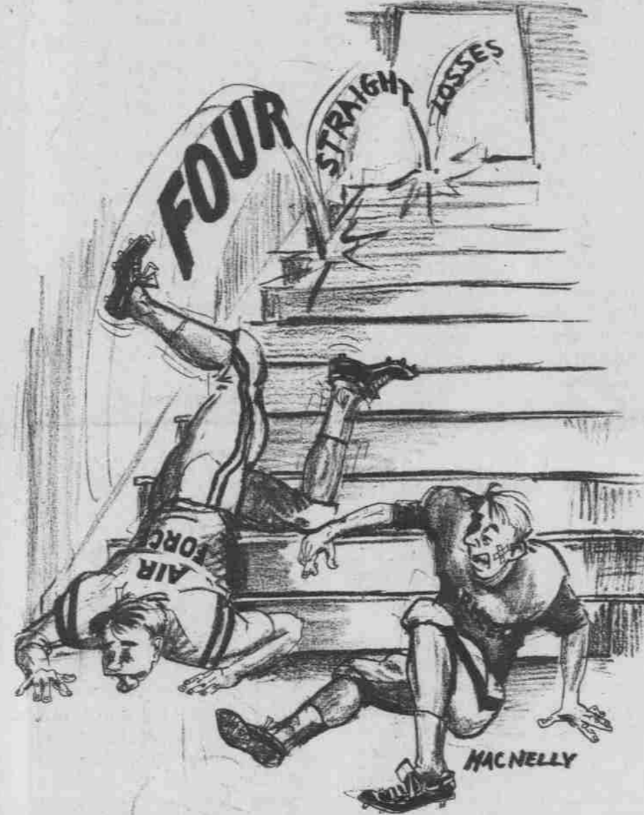
"Hey, Fella, Wanna Fight?"

Belgians are the greatest beer drinkers in the world, beating even the suds-loving Bavarians.