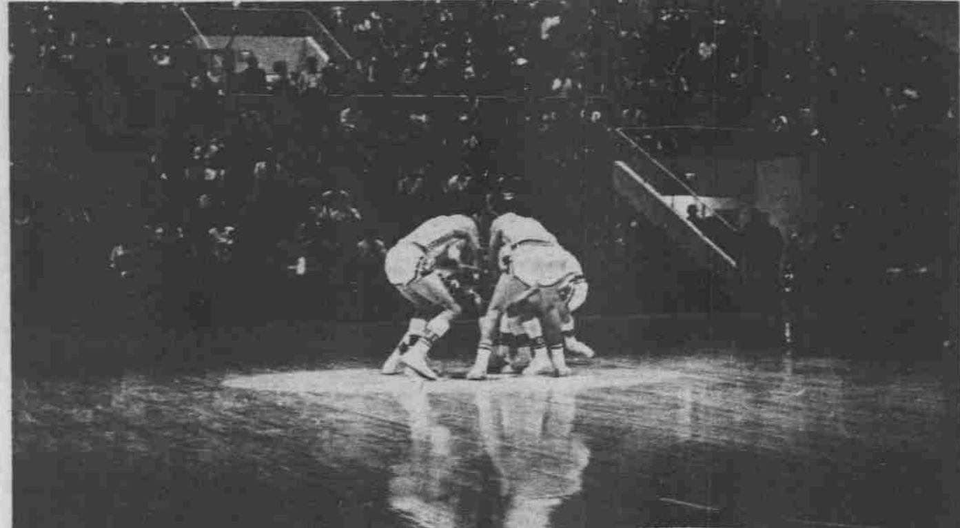
The 1966-67 edition of the Tar Heel basketball team could be one of the most exciting here in years. You can get a sneak preview of the team at its intra-

The Tar Heels open the season against Atlantic Coast Conference rival Clemson here on Dec. 1. Carolina season tickets for nine home games at Carmichael Auditorium currently are on sale to the general public.