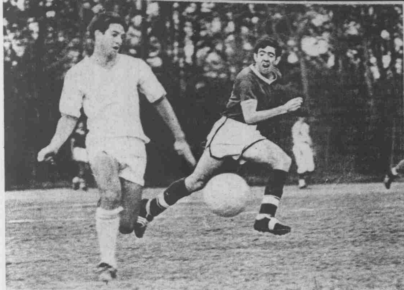
HAPPY DAYS — Yesterday afternoon's tight soccer game with Duke was a dandy. UNC emerged unscathed in the fourth quarter, 4-1. This chunky victory give the Tar Heels