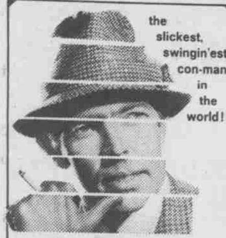
the slickest, swingin'est con-man in the world! COLUMBIA PICTURES Presents JAMES COBURN

DEAD HEAT ON A MERRY-GO-ROUND EASTMAN COLOR