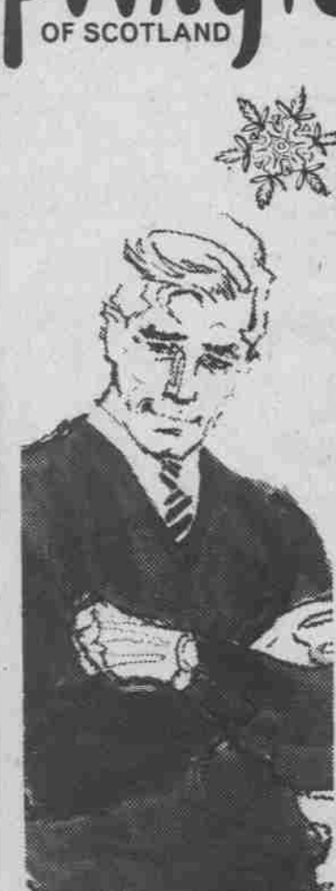
100% Imported Wool Pullover by PRINGLE

Everything about this soft, warm pullover speaks with full confidence. Its fine gauge imported wool is sheer luxury to the touch. Classically styled with the V-Neck in today's narrow