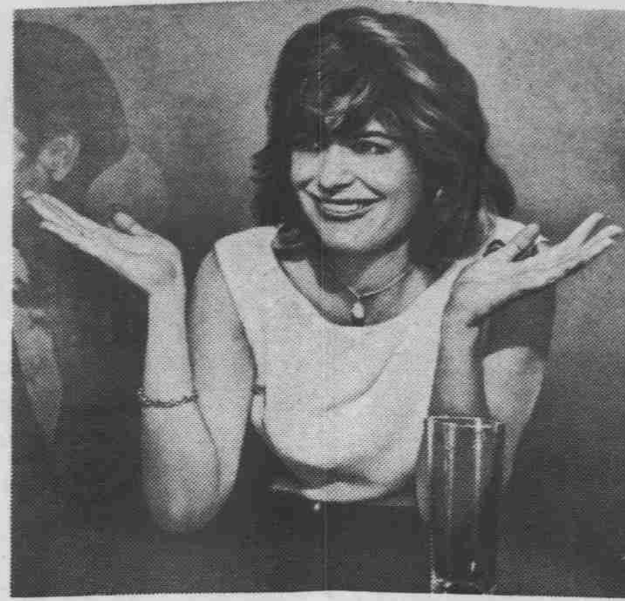
CONDEMNED — Melina Mercouri stars as a restless wife in "10:30 P.M. Summer," which opens today at the Rialto Theater in Durham. Melina says it's her best role yet, even though the Legion of Decency gave the picture a condemned rating because it contains a salacious love scene. Also starring are Romy Schneider and Peter Finch.