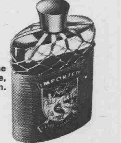
Raffia Cologne and After-Shave, Lime or Bay Rum.

THEY'RE WANTED MEN Soft-spoken. Well-mannered. But extremely dangerous. Usually seen in the company of beautiful women. Prefer conservative dress, fine imported colognes for men. Specifically, Raffia, from which they take their name.