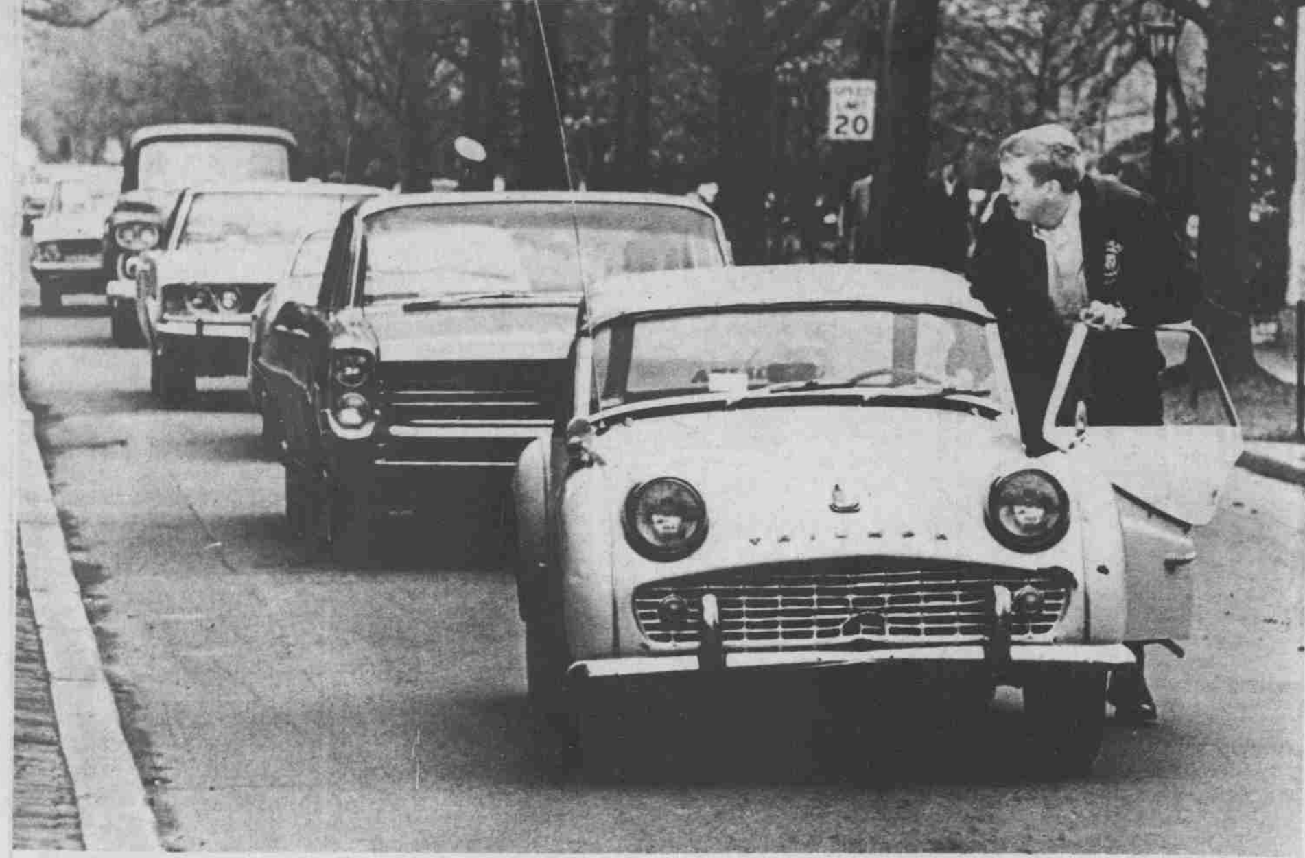
WHEN THE WHOLE rush hour street is waiting behind you to get your out-of-gas Triumph out of the line of traffic, then's