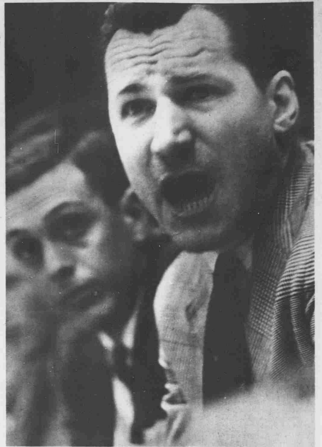
Coach Dean Smith Ran a Tight Show