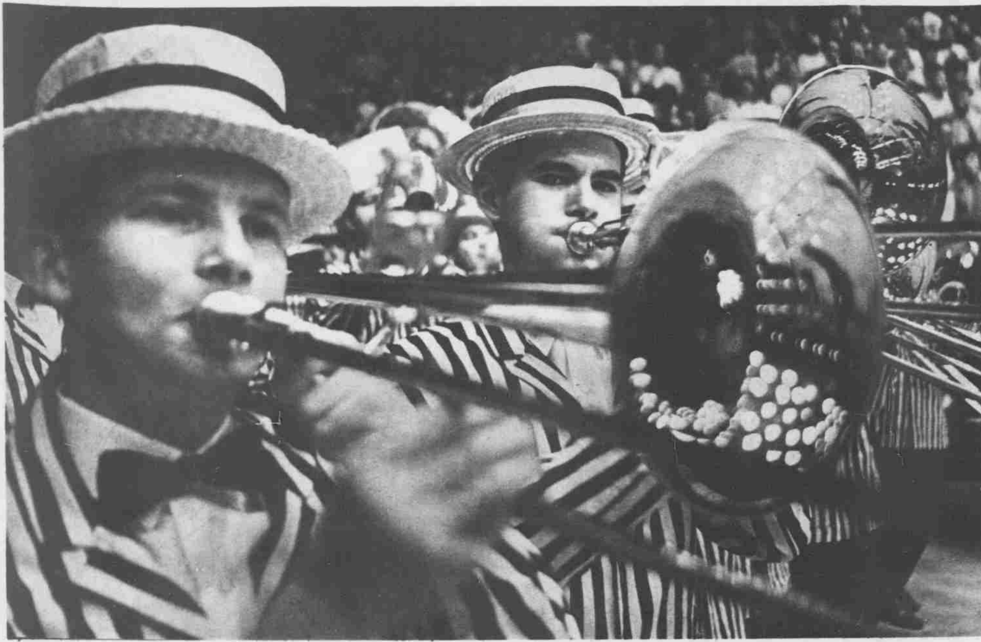
Duke Had Noise, But That Wasn't Enough To Topple a Determined UNC Team