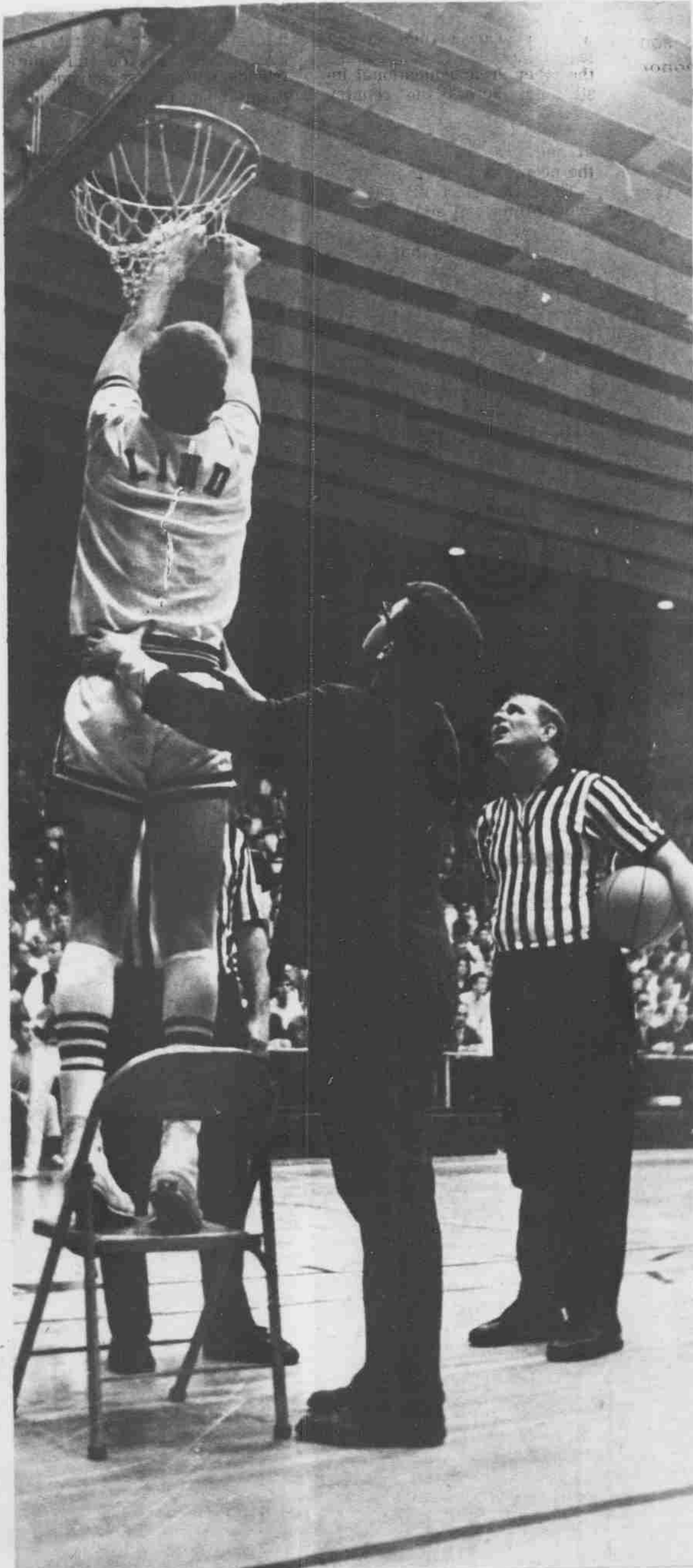
Shooting Was So Hot, They Had To Replace The Net . . .