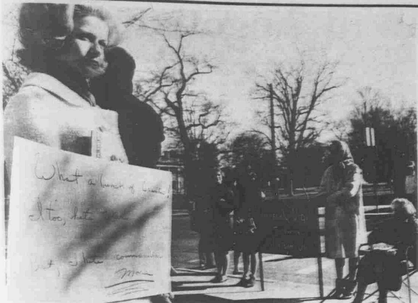
BATTLE OF THE SIGNS raged in silence at yesterday's weekly peace vigil. The noontime event attracted upwards to 230 people, almost double the number that stood in the freezing rain for the first vigil last week.