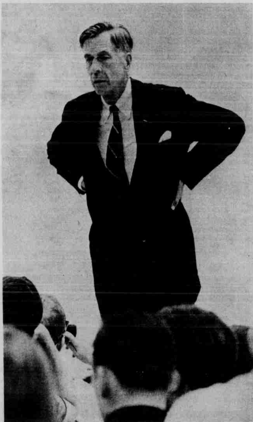
JOHN KENNETH GALBRAITH answers questions of delegates in special session Saturday night.