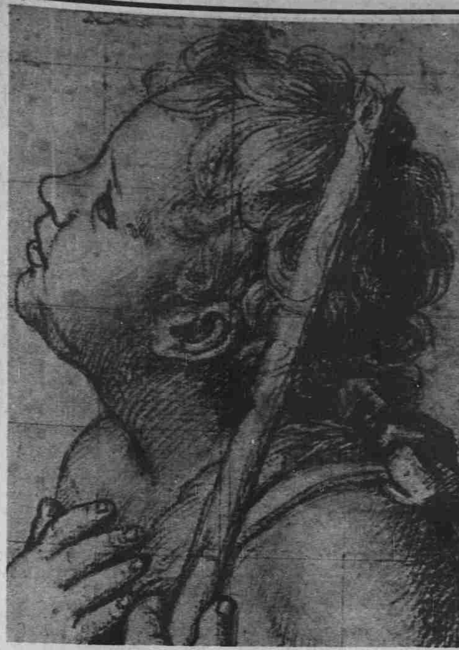
INFANT ST. JOHN FROM A HOLY FAMILY. a chalk print by Raphael, is part of the collection to be shown at Ackland Art Center starting October 8.

The Tuesday Evening Series is sponsored weekly by the Music Department and will bring to the campus a wide variety of vocal and instrumental soloists and ensembles this year. Each performance is open to the public without charge.