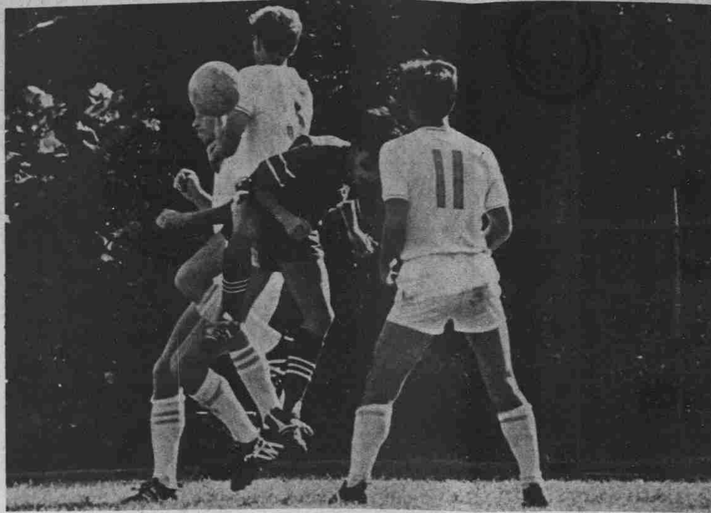
Mixing it up