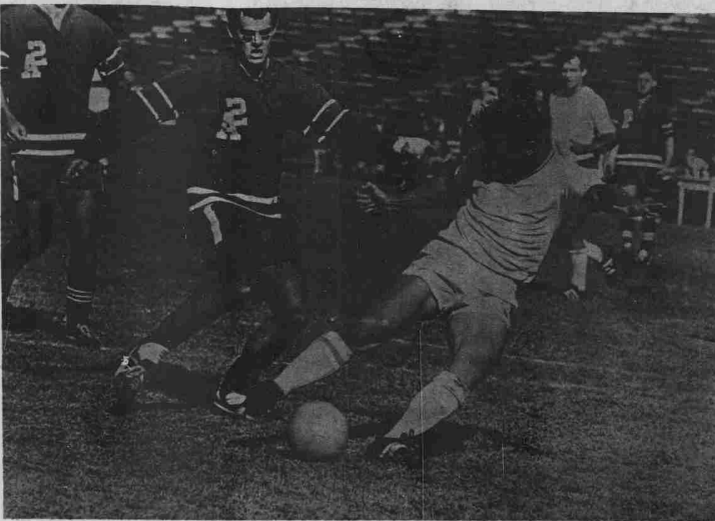
A successful tackle