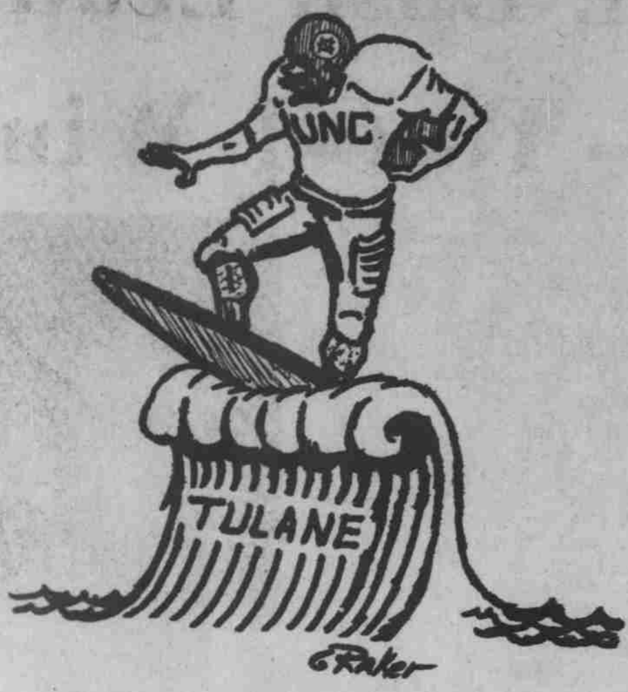
Tar Heels Out To Ride Green Wave Today.