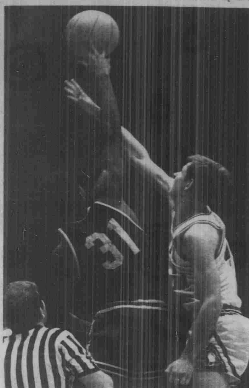
Frosh Tip Off Another Bonus Season