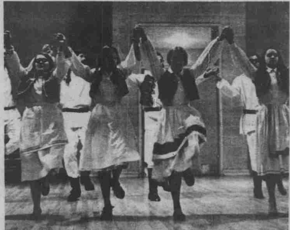
METUMTAM SOKOLE FOLK DANCERS