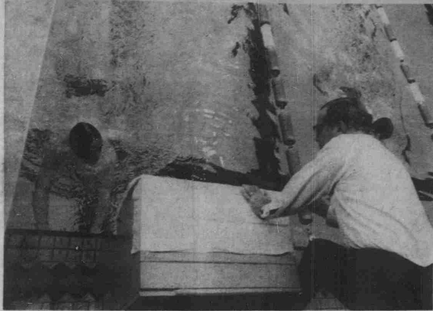
Williams finishes second in the 200 yard breaststroke