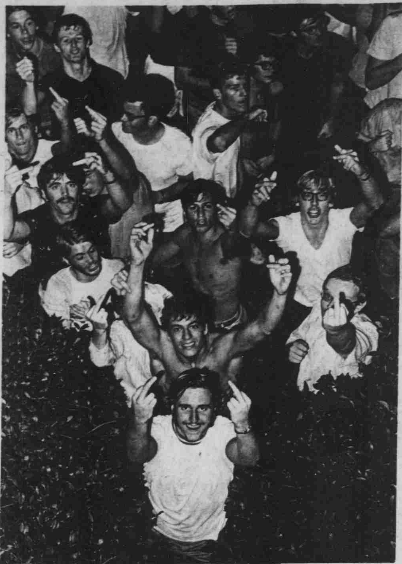
The girls in Cobb Dorm looked out of their windows late Sunday night to face the fall's second pantie raid in three days. The group at left responded in unison to