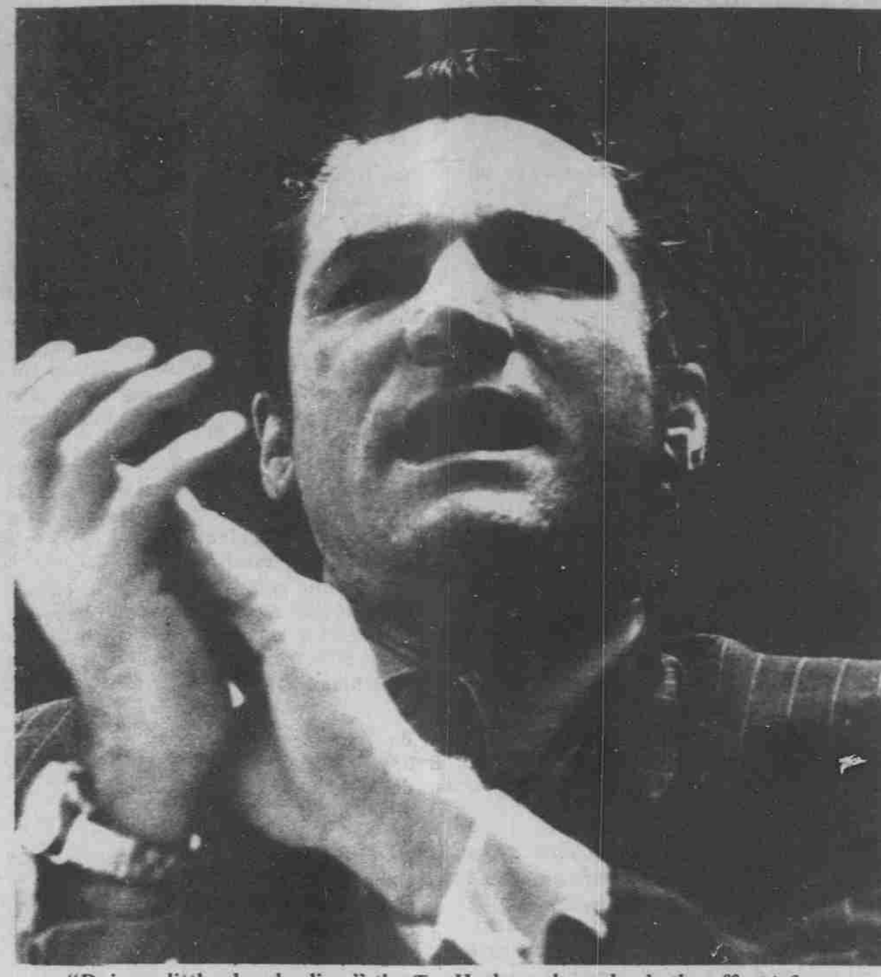
"Doing a little cheerleading," the Tar Heel coach applauds the effort of one of his players.