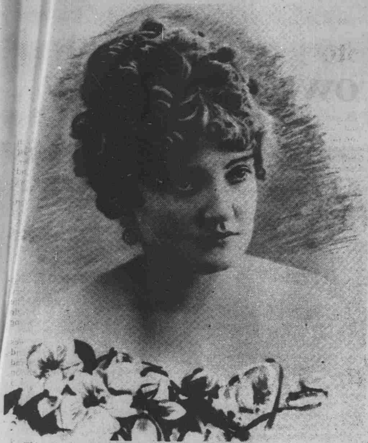
This rare photograph shows Baby Doe as she appeared shortly after her marriage to Horace Tabor. By the way, does she look smug?