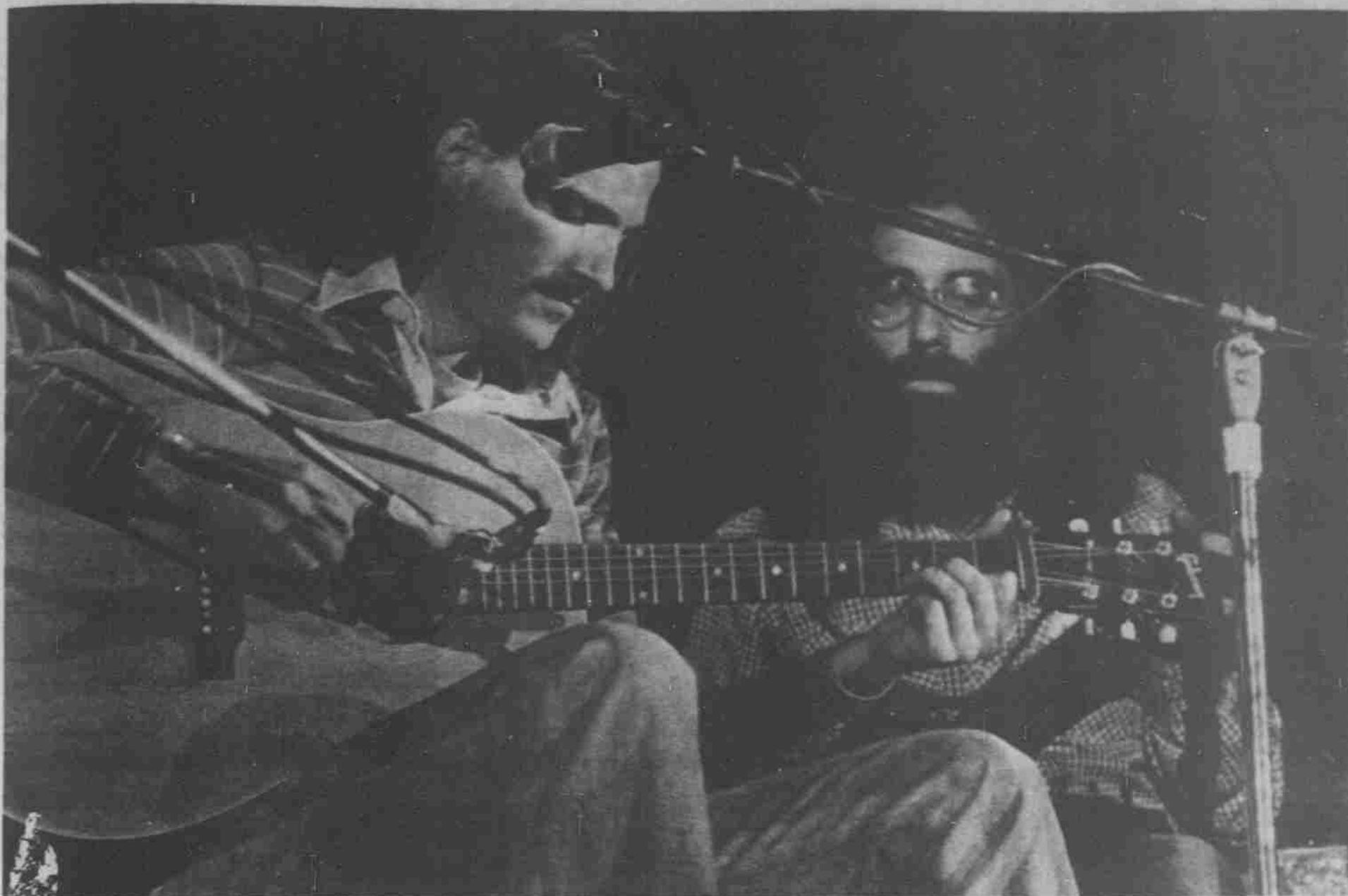
James Taylor was joined Thursday night by a musician of some repute, Leon Russell. Russell was up-front pianist for Joe Cocker's Mad Dogs & Englishmen combine. Russell plays a number of other instruments besides the piano. He has also won an ardent following among his fellow