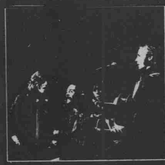
CROSBY, STILLS, NASH & YOUNG FOUR WAY STREET

AND... Just 'Cause We're Nice Guys (And Gals) ALL OTHER ALBUMS ON ATLANTIC & ATCO ARE ON SALE All 4.98 List