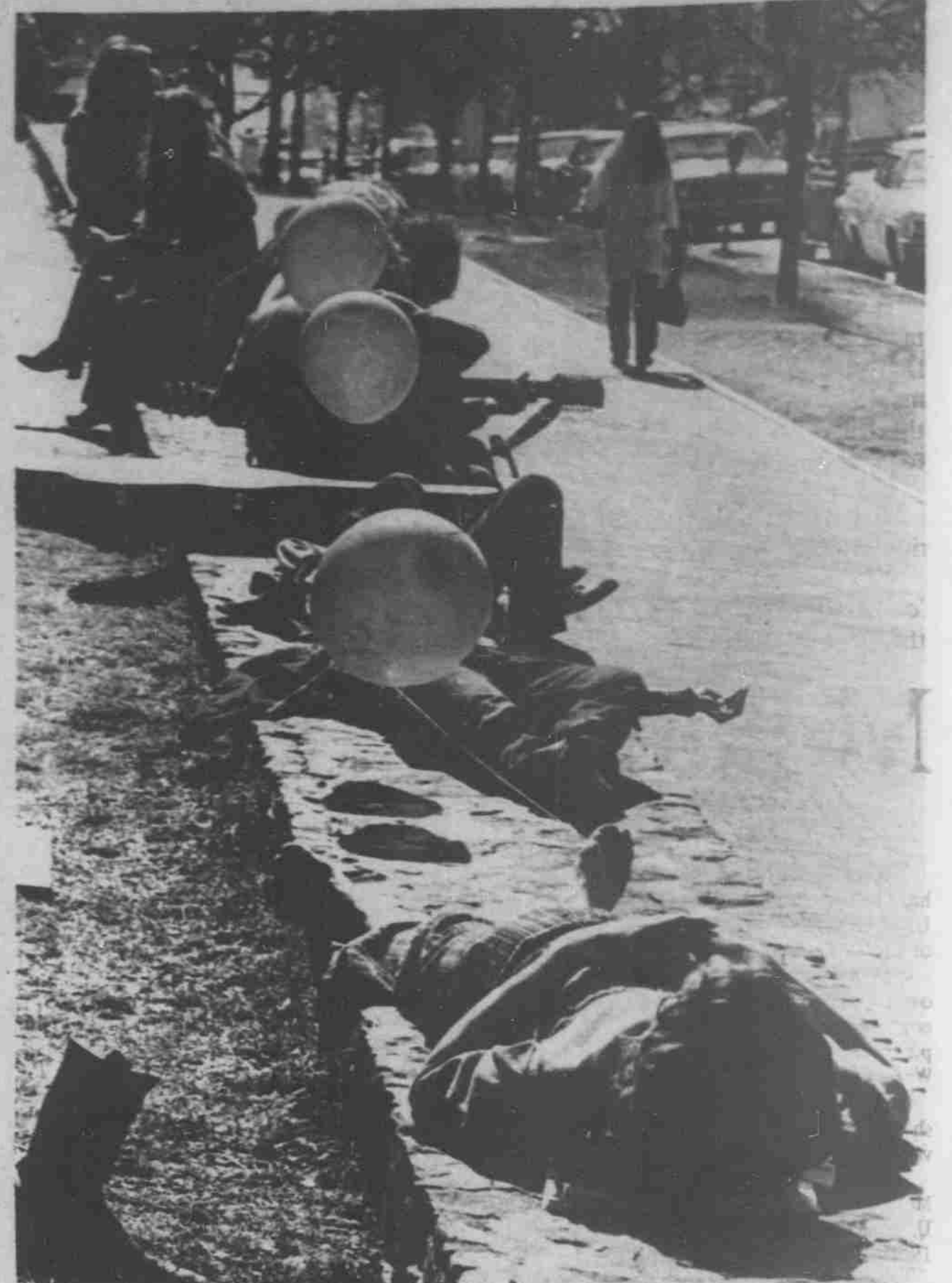
Thursday was a lazy day. Just right for stretching out and taking a snooze in the sun. But what about your Campus Chest balloon? Why tie it to your big toe, of course.

Governors, lieutenant governors, and various members of the residence college administrative staff were encouraged to attend.