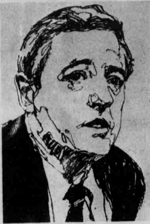
William F. Buckley

Devout Catholic William F. Buckley, Jr., confronts the leading advocate for separation of church and state, Madalyn Murray O'Hair on the third program of the new "Firing Line" series on university television, WUNC-TV, Channel 4. The show will be aired on Sunday night, June 13 at 7 p.m.