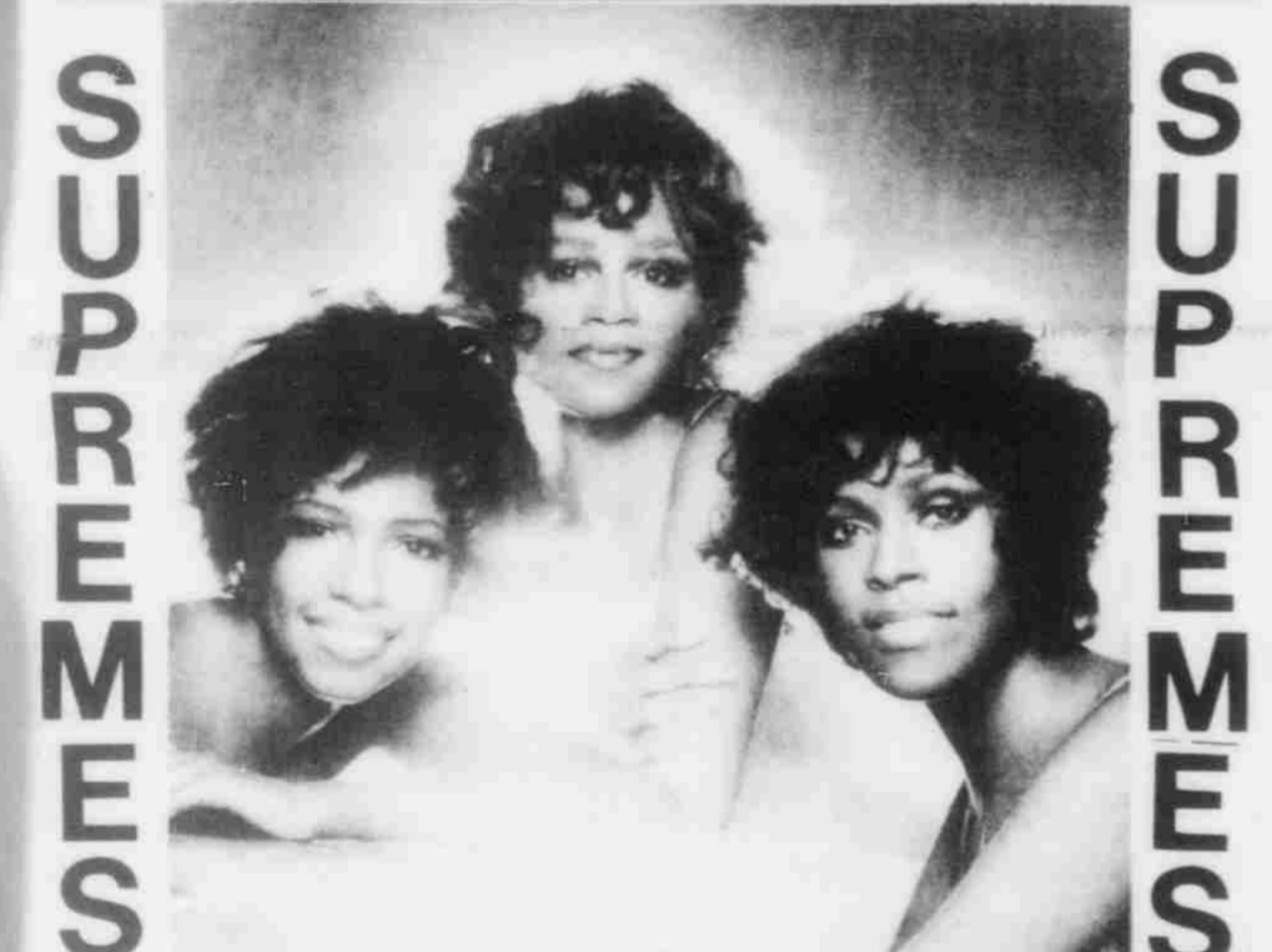
The Supremes will appear in concert Oct. 23, 8 p.m. at Carmichael Auditorium. Tickets $2.00

Anyone interested in forming car or tent pools should come by the ECOS office, Suite B, Student Union or call 933-6757.