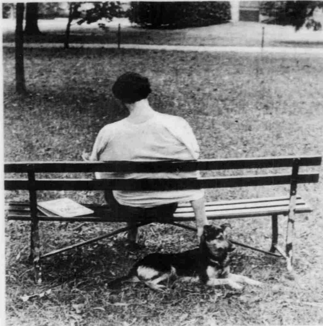
Man's best friend can be a big help when one is studying for a midterm. This student seems to be enjoying the comfort of his dog while studying in McCorkle Place.