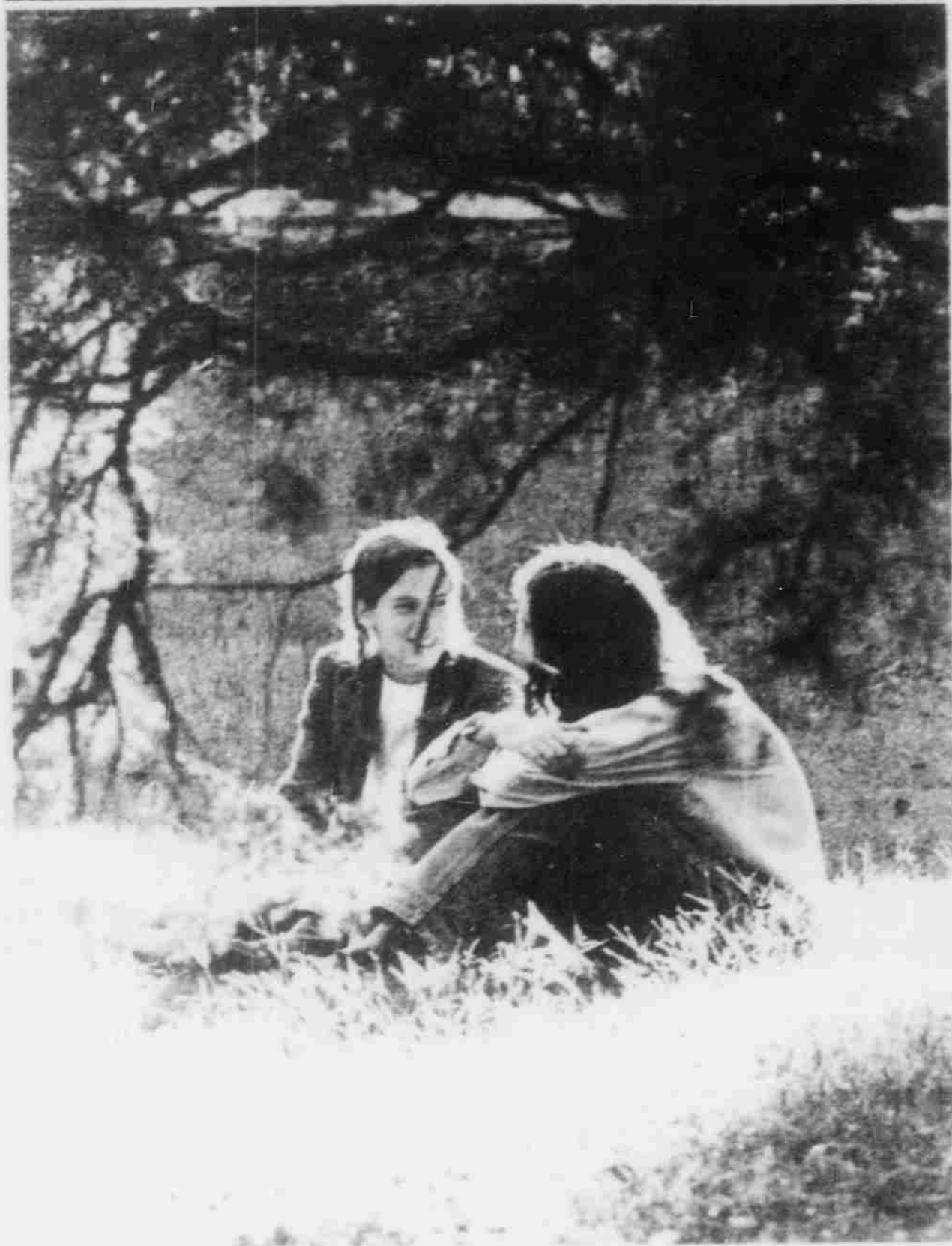
This couple spends a few quiet moments together in the Arboretum. What more can one ask than peace and quiet, and someone you love.