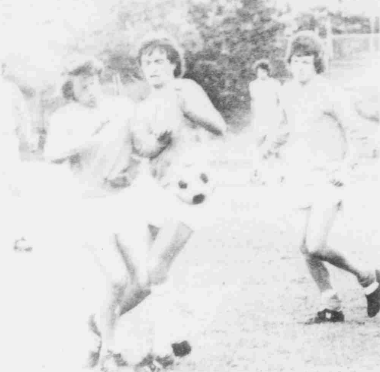
UNC players mix it up with players from South Florida in Friday's soccer match. UNC won the match, 4-1.