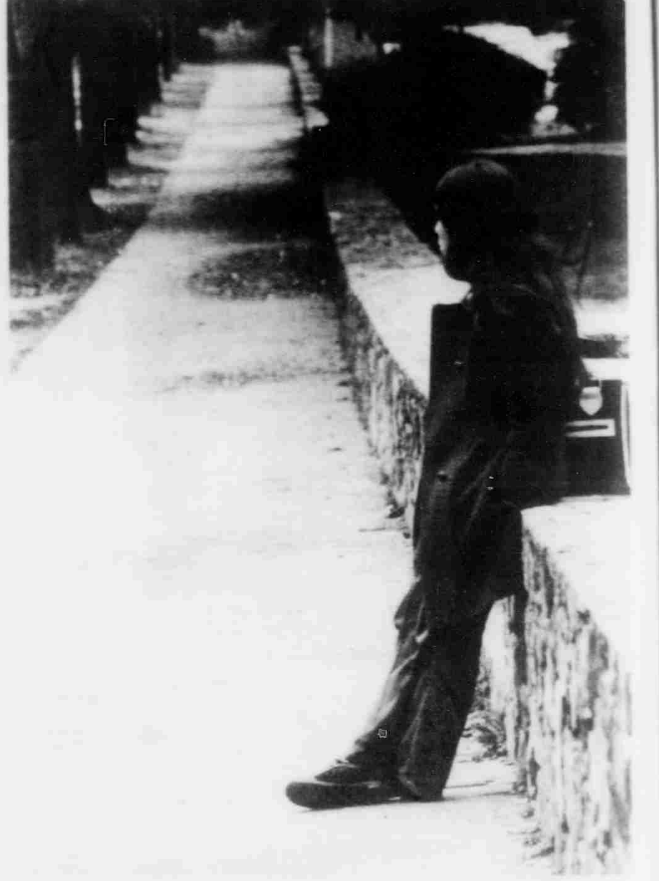
A UNC coed stands alone along the McCorkle Place wall. It was rather chilly in Chapel Hill Tuesday, and the usually active wall area was quiet.