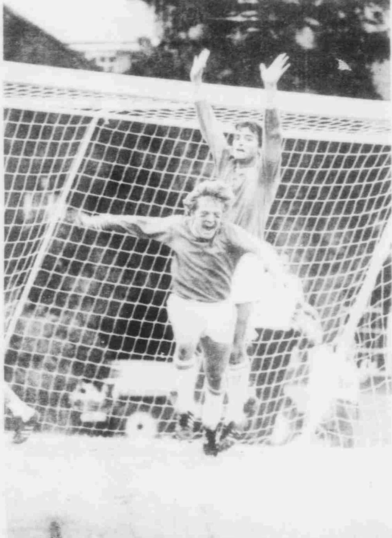
UNC booters celebrate the final goal of the game. The Carolina soccer team ended a losing streak with a 5-3 victory Friday over Duke.

The Tar Heel victory ironically handed the ACC championship to Maryland, which whipped Carolina 3-1 on Monday. Duke finished second in the conference; while UNC's 2-2-1 ACC record gives the Tar Heels a third-place tie with N.C. State.