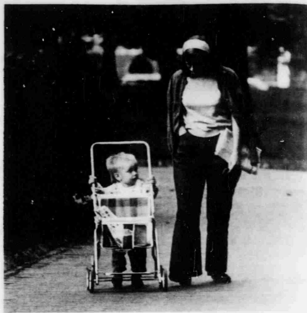
The younger generation is certainly more obstinate today than in previous years. It used to be that the mother pushed the baby carriage — with the baby in it.