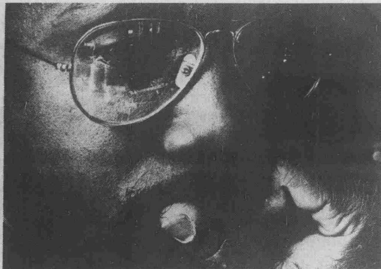
Janice Ian (left) brings mellow music, including her hit song, 'At Seventeen,' to UNC on Nov. 7. Percussionist Billy Cobham (above), who has performed with Miles Davis and the Mahavishnu Orchestra, comes to Carolina with his own brass sextet on Sept. 19.

Janice Ian has been reborn in 1975. A victim of the all too fleeting stardom of the pop-rock world, Ian dropped out of sight following a solitary hit, a mid-'60's protest song entitled "Society's Child." Now, after three years of self-imposed exile, Janice Ian is back. Her poignant hit single "At Seventeen"