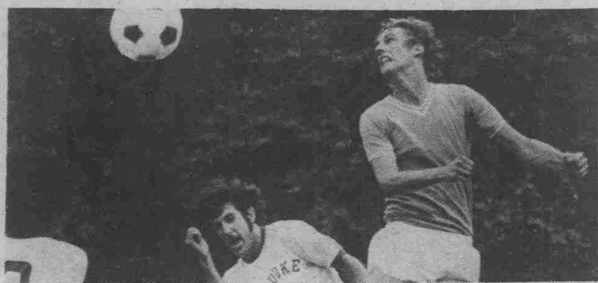
UNC head-eye coordination