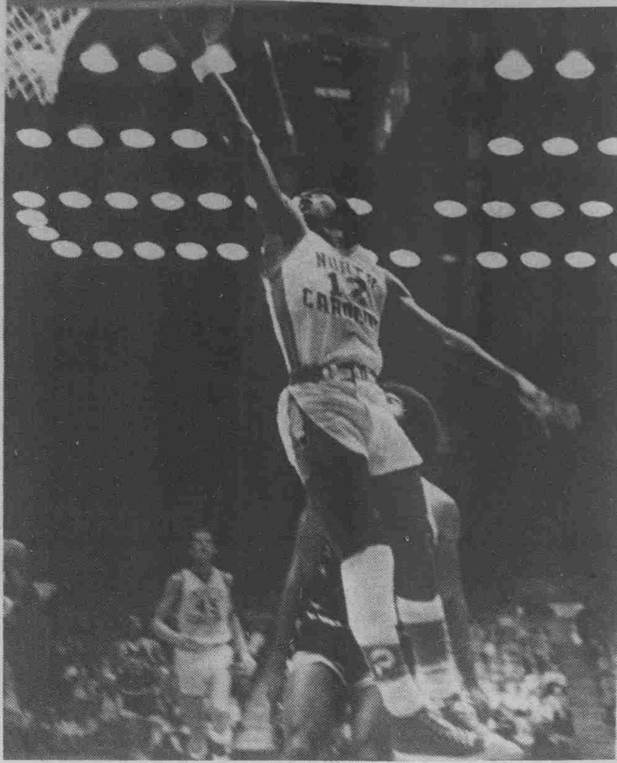
UNC sophomore guard Phil Ford drives in for two of his 15 points against Howard Saturday. Ford handed out 14 assists to break the previous UNC single-game record set by Larry Brown, now coach of the American Basketball Association's Denver Nuggets, against South Carolina in 1963.

The Tar Heels travel to New York Thursday to take on Seton Hall as part of a doubleheader in Madison Square Garden. Carolina then returns to Chapel Hill on Saturday for its next home game against Virginia Tech.