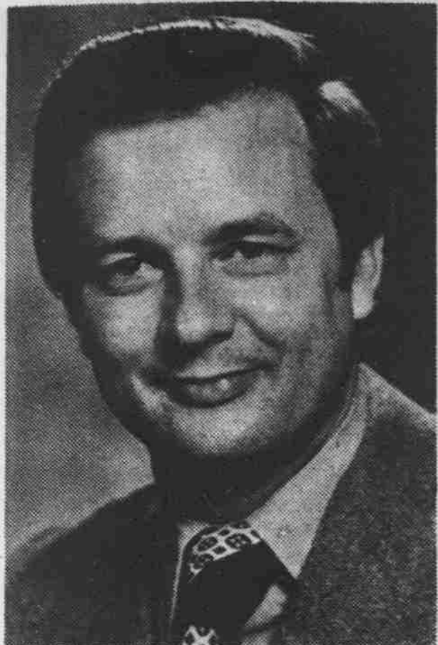
Gov. James Hunt