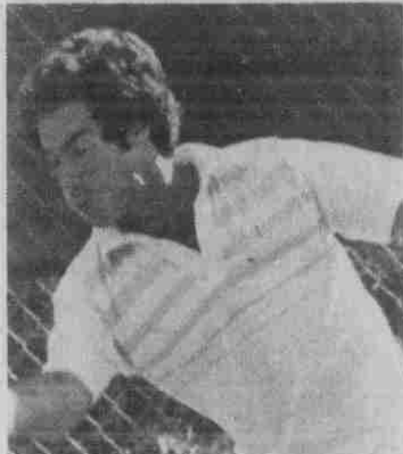
Kraut had win vs. Miami

For more information and ticket reservations call the box office at 933-1121.