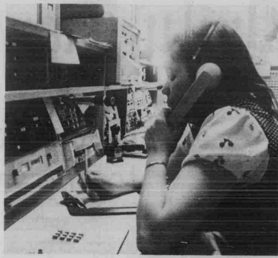
Under the new countywide 911 emergency telephone system, the dispatcher at the Chapel Hill Police Department coordinates incoming calls for police, fire, and rescue assistance. The system will help speed aid to the scene.