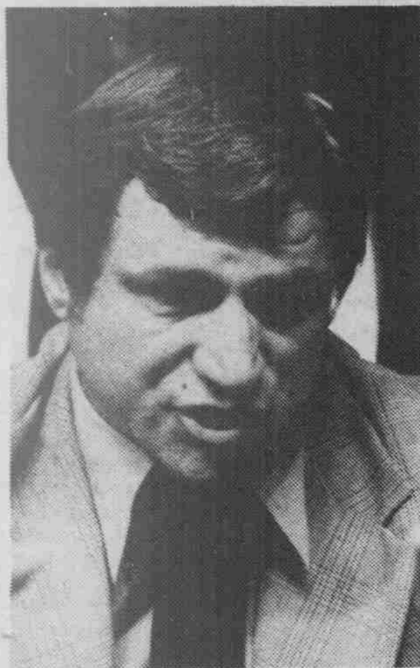
Carolina's Dean Smith ...questions expansion

Duke said the addition of a third official will probably encourage most conferences and independents to follow suit during the coming season.